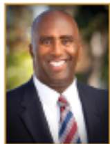
Jim Cooper (D)

District Office 2729 Prospect Park Drive, #130 Rancho Cordova, CA 95670 916.464.1910